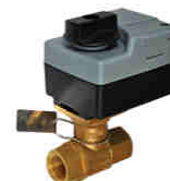
Motorized Valve Electric Return (Option)

Trane Motorized Valve/ Spring or Electric Return (1 Year Warranty) is used to open/close the chilled water piping system to control the room temperature according to the thermostat's set point. Recommend to use with Trane Thermostat for precise temperature control.