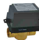
Motorized Valve Spring Return (Option)

TPICCV Trane Pressure Independent Characterized Control Valves (Option - 5 Years Warranty) combines a differential pressure regulator with a 2-way control valve which supplies a specific constant flow for each degree of valve opening regardless of pressure variation in the system. Recommend to use with Trane Thermostat for precise temperature control.