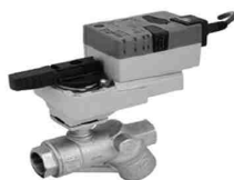
TPICCV Valve (Option)

** Front Blade, Louver and Sweep functions are available for only model CFEB04-12